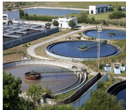
Typical WWTF settling tank and clarifiers

Under a recently launched partnership with the Environmental Protection Agency’s (EPA) Office of Wastewater Management, the IACs are working closely with public and private water utilities to save and recover energy, speed implementation of new technology and best practices, and reduce the energy intensity of water treated, delivered, and reused.